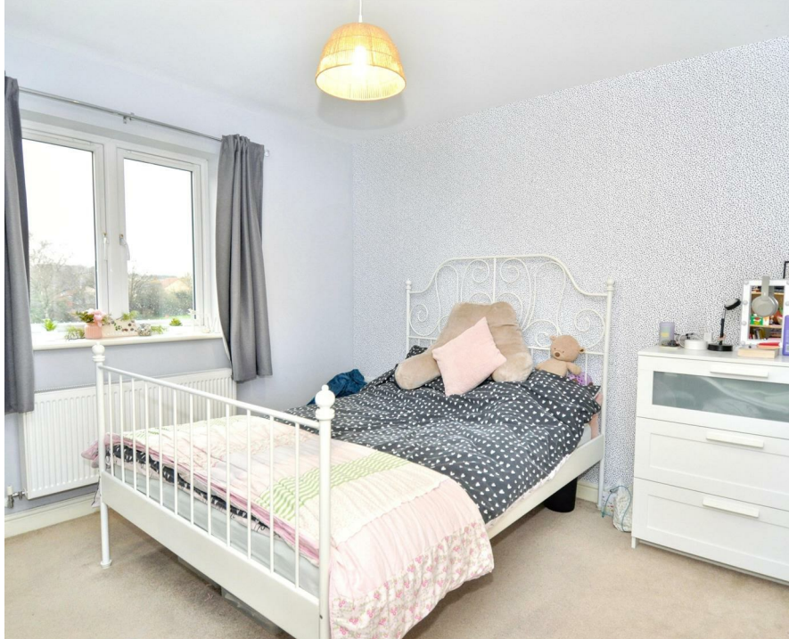
"Tucked Away Position"